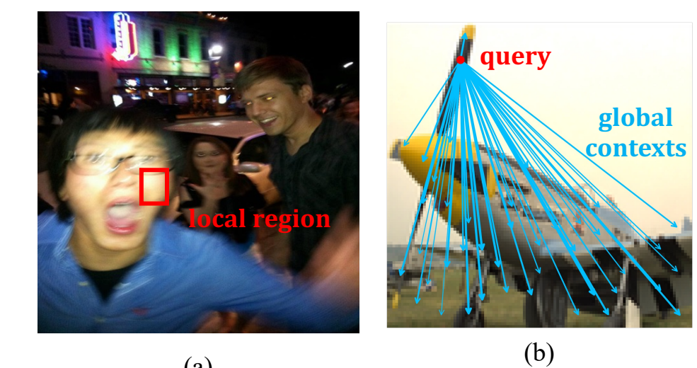
Figure 2: Local region feature extraction and non-local dependency feature extraction